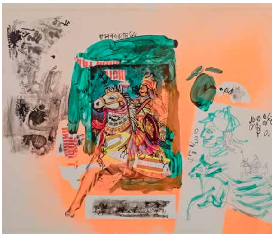
P. Mansaram, Maharana Pratap (detail), mixed media on paper, 1967.

The exhibition P. Mansaram: The Medium is the Medium is the Medium thinks through the artist's decades-long practice of repetition. Strategically using recurrence and reproduction through a variety of media including drawing, painting, collage, text, sculpture, xerox, silkscreen printmaking, and film, P. Mansaram invokes unending feelings of travel: through time, dimension, and territory.