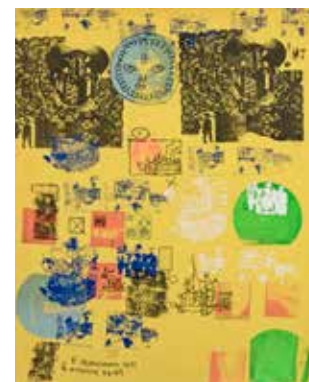
P. Mansaram, Machine & Khajuraho (detail), 1971, mixed media on canvas.