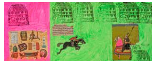
P. Mansaram, Maharaja #2 (detail), mixed media on plywood, 1969.

Selected works included in this exhibition highlight both material and spiritual elements from the artist's surroundings and everyday life—including characters, symbols and spaces—to convey the artist's meditative and transcendent processes in both form and content. In that regard, the ways in which P. Mansaram assembles different media and creates a sense of place present the viewer with a nuanced narrative of the diasporic experience.