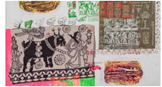
P. Mansaram, Rear View Mirror #19 (detail), 1970, mixed media on canvas.

Repetition is practice. Repetition is tedium. Repetition is love. Repetition is mastery. Repetition is play. Repetition is memory. Repetition is cleansing. Repetition is purposeful. Repetition is control. Repetition is transcendence. Repetition is meditation. Repetition is work. Repetition is concentration. Repetition is contemplation. Repetition is disruptive. Repetition is building. Repetition is starting over. Repetition is futile. Repetition is insistence. Repetition is boring. Repetition is god. Repetition is practice, again.