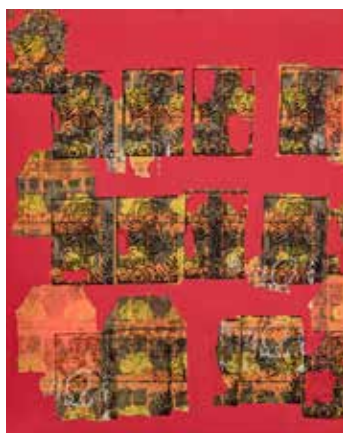
P. Mansaram, Untitled 1 (detail), 1970, paint on sheet metal.

He chose to create disruption to create continuity. Disruption became his medium.